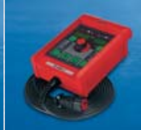
JobMaster with integral remote-control functionality