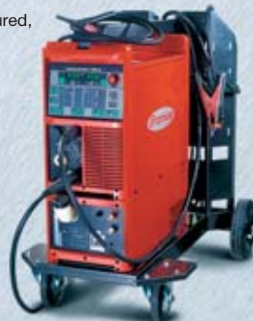
TPS 2700 TIG: Perfect TIG welding, thanks to special functions and multiprocess capability