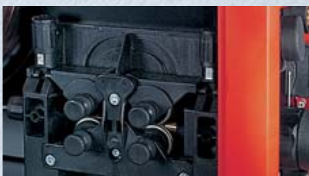
4-roller drive integrated within the power source, for smooth, precision wirefeed