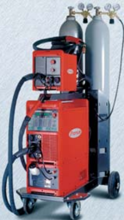
TPS 2700 Duo: Makes it easy to weld two different materials at once using an extra wirefeeder

Finally, there is the TPS 2700 TIG , which comes with some special TIG-welding capabilities. Like TIG Comfort Stop, for example. This function cures the arc of its annoying habit of breaking at the end of welding. Uninterrupted gas shielding is ensured, and the end crater is filled to perfection.